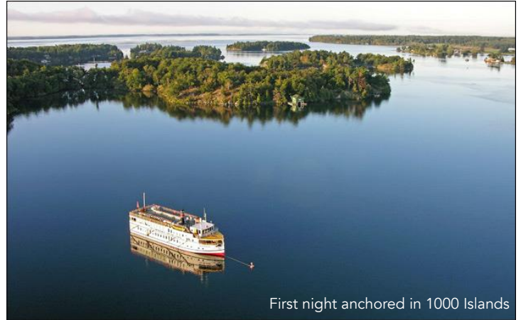
First night anchored in 1000 Islands

With each nautical mile, nature's northern masterpiece unfolds. Within one 80-kilometre stretch of the mighty St. Lawrence River, there are no less than 1,870 islands. In these "1000 Islands", birthplace of the famous 1000 Islands Dressing, we explore intricate river channels, sumptuous greenery, mysterious coves, and nooks and crannies veiled in folklore. We sail past summer cottages, opulent mansions and even two castles, Boldt and Singer. These islands have been the summer homes of the rich and famous: the Astors, the Pullmans, the McNallys, Helena Rubenstein, Irving Berlin, Mary Pickford, and a host of others. We cruise under several bridges including the multiple spans of the Thousand Islands Bridge. The New York Times wrote, "When the time comes for sleep, sleep comes easily on a ship surrounded by a thousand islands and a million stars."