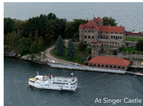
At Singer Castle

Wells Gray Tours has offered seven cruises on the Canadian Empress since 2016 with excellent reviews. Come and experience a different kind of river cruising on an intimate ship.