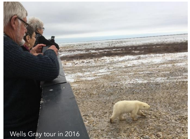
Wells Gray tour in 2016

Comprehensive travel insurance is required by the Churchill tour company including without limitation medical, emergency evacuation, trip cancellation, and interruption insurance. If you do not buy insurance through Wells Gray Tours, it is essential that you check your policy carefully. Insurance with your credit card or employee benefits may not cover what you need.