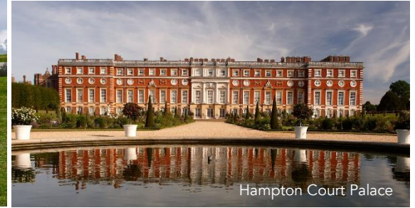
Hampton Court Palace