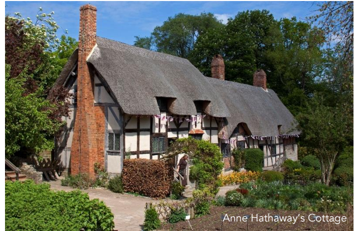
Anne Hathaway's Cottage