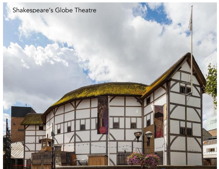
Shakespeare's Globe Theatre