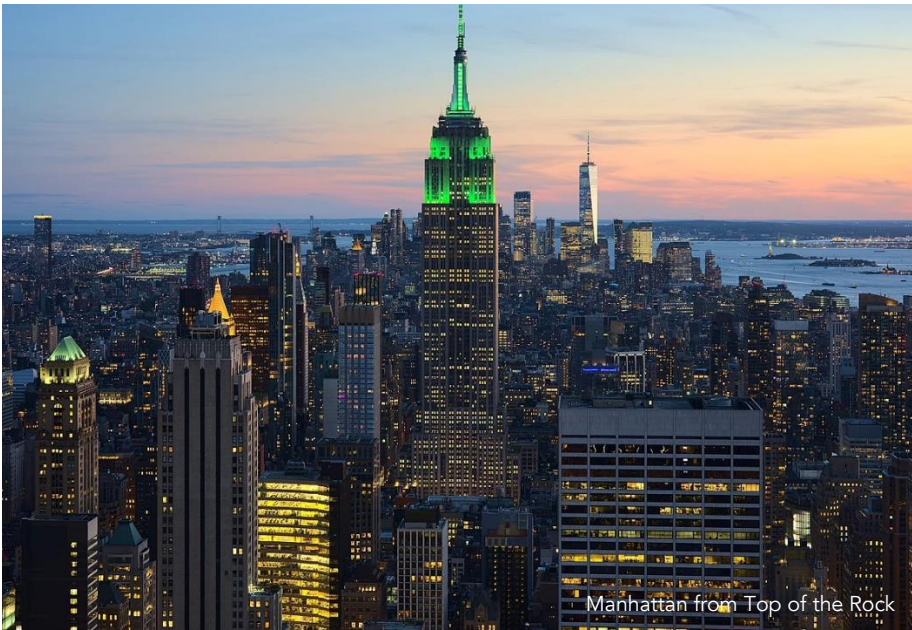
Manhattan from Top of the Rock