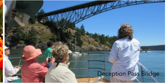
Deception Pass Bridge