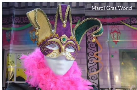
Mardi Gras World