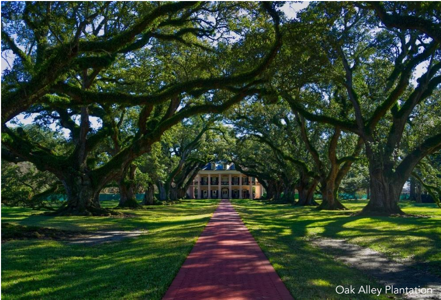
Oak Alley Plantation