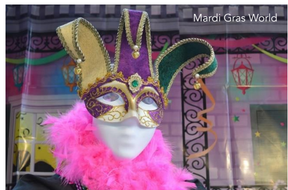
Mardi Gras World