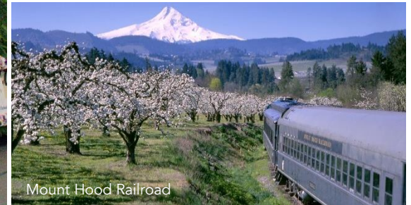
Mount Hood Railroad