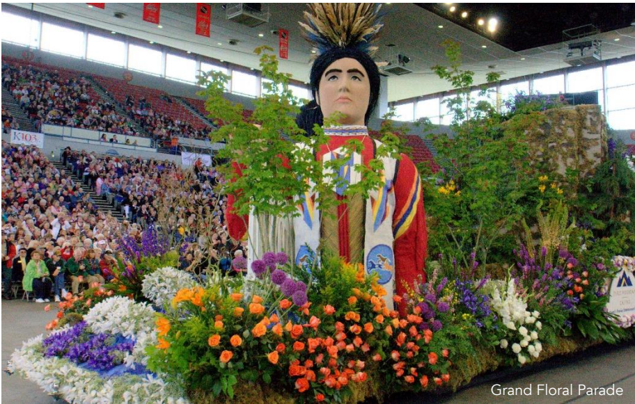
Grand Floral Parade