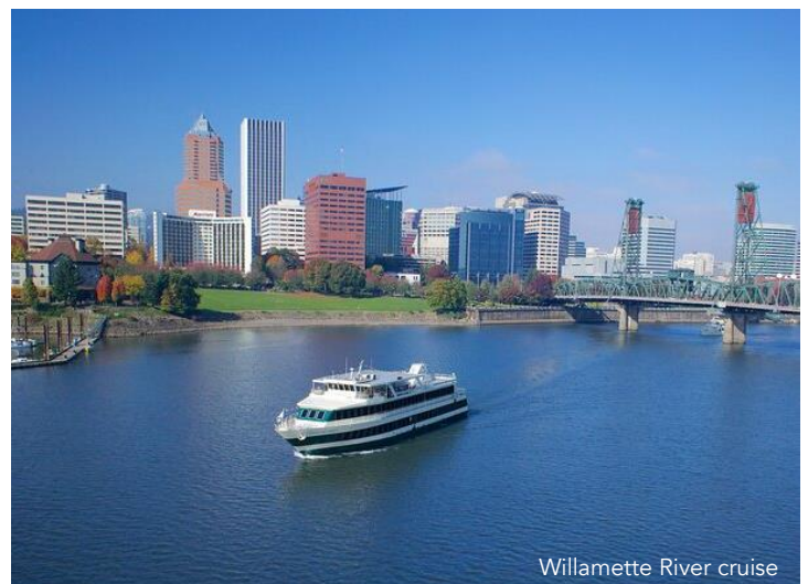
Willamette River cruise