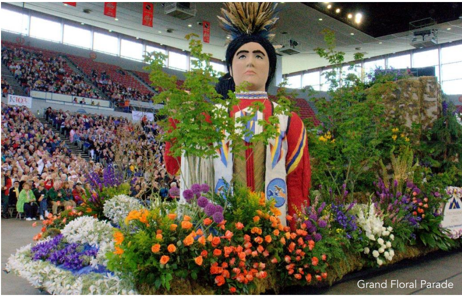
Grand Floral Parade