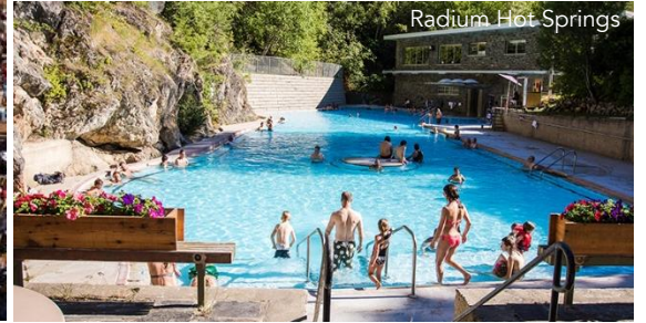
Radium Hot Springs