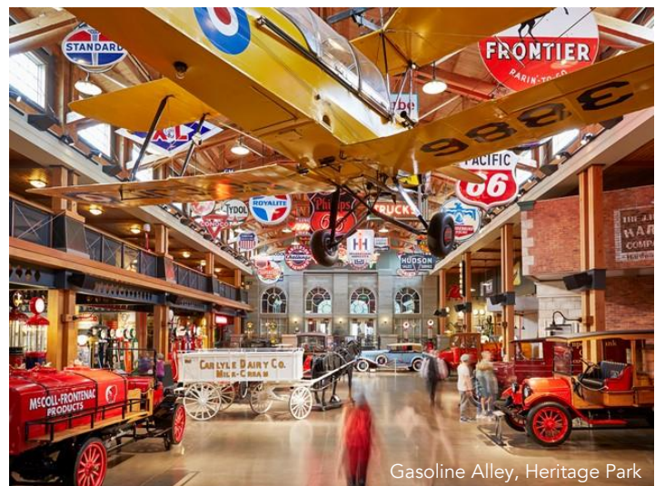
Gasoline Alley, Heritage Park

Departure from: Victoria, Nanaimo, Comox