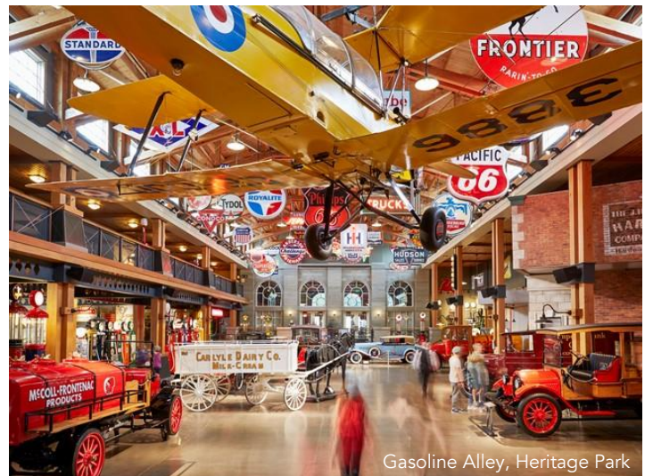
Gasoline Alley, Heritage Park