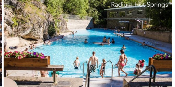
Radium Hot Springs