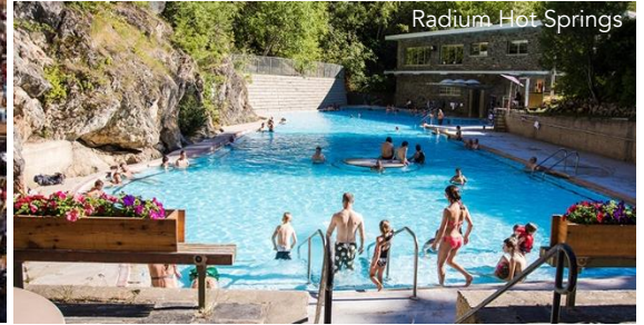
Radium Hot Springs