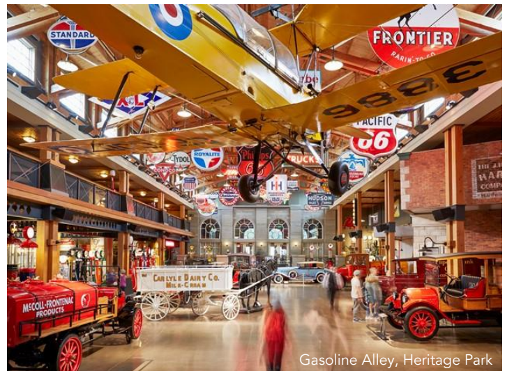
Gasoline Alley, Heritage Park