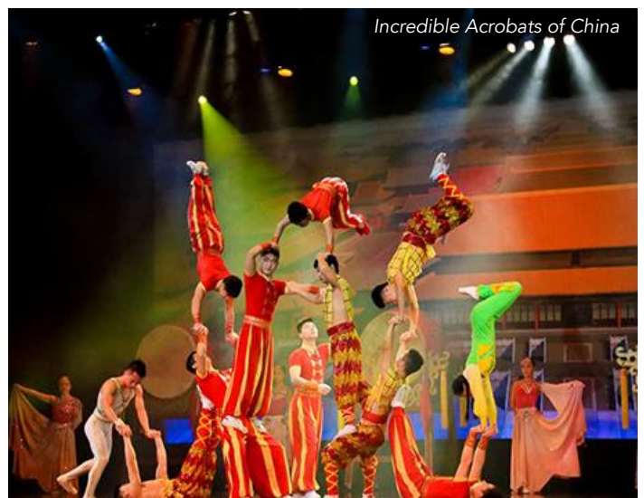
Incredible Acrobats of China