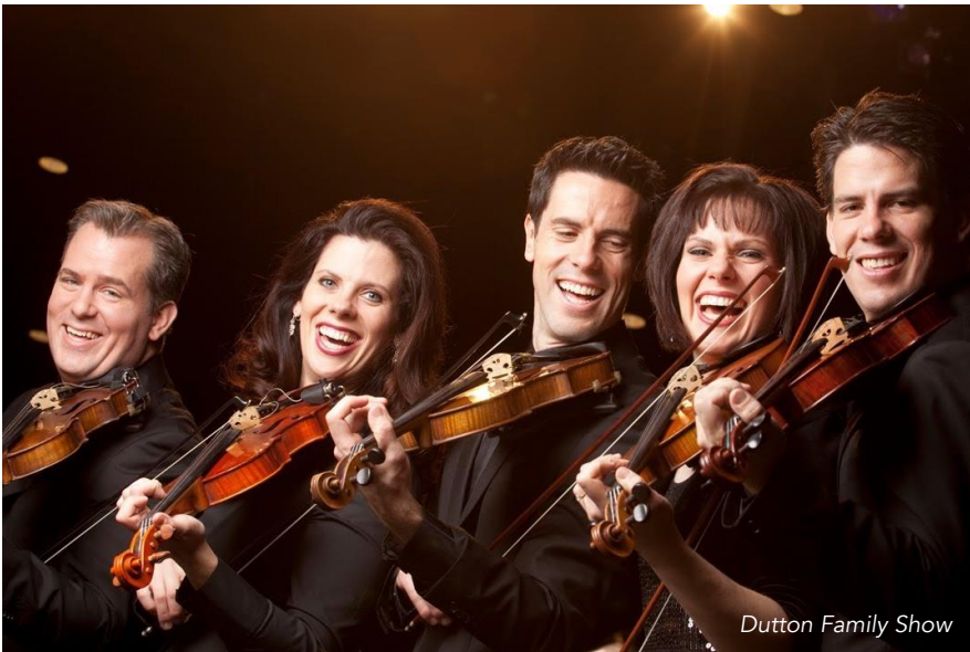
Dutton Family Show