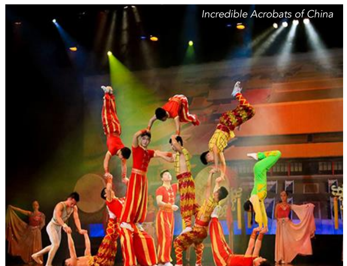
Incredible Acrobats of China