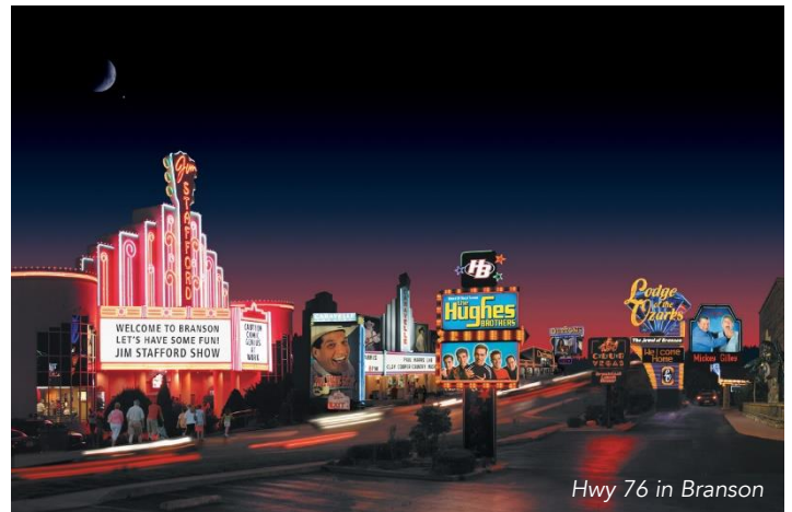
Hwy 76 in Branson

Jamboree opened the first live musical show in Branson in 1959, but the first theatre on Highway 76 was Presley's Mountain Music Jubilee in 1967. Branson began its transformation into a major tourist attraction in 1983 when the Roy Clark Celebrity Theatre opened and began to bring famous country music stars to Branson. During the next ten years, performers such as Box Car Willie, Andy Williams, Shoji Tabuchi, and Glen Campbell built their own theatres. The television series 60 Minutes aired an episode in 1991 which declared that Branson was the "music capital of the entire universe", much to Nashville's chagrin. Currently there are 40 theatres operating in Branson and it has more theatre seats than Broadway or Las Vegas. It has been named the #1 U.S. destination for groups for many years and entertains more than six million visitors annually, but has a year-round population of only 11,000. Branson's title today is the "Live Music Show Capital of the World."