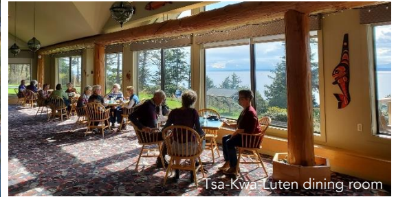
Tsa-Kwa-Luten dining room