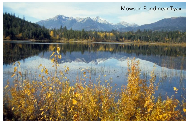
Mowson Pond near Tyax