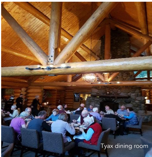
Tyax dining room