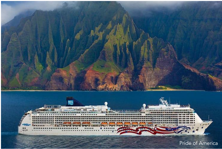
Pride of America