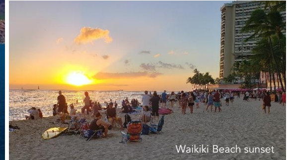
Waikiki Beach sunset