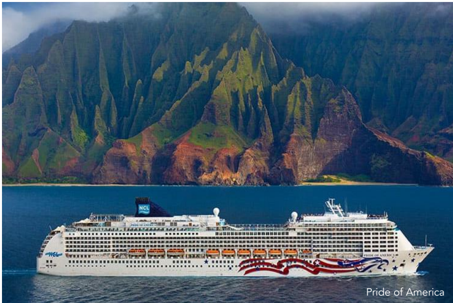
Pride of America