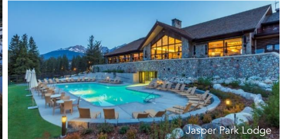
Jasper Park Lodge