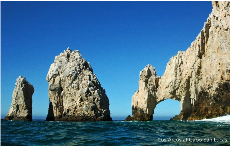
Los Arcos at Cabo San Lucas