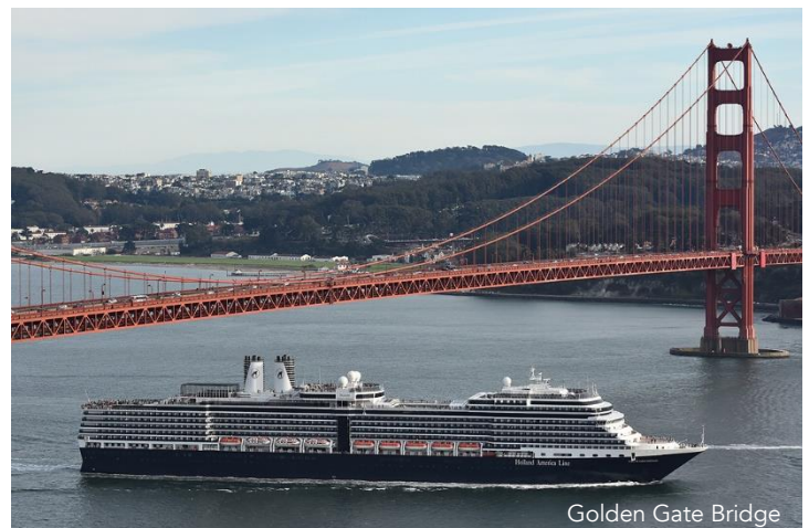
Golden Gate Bridge