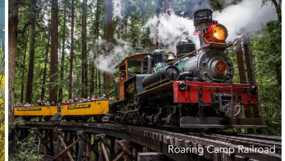
Roaring Camp Railroad