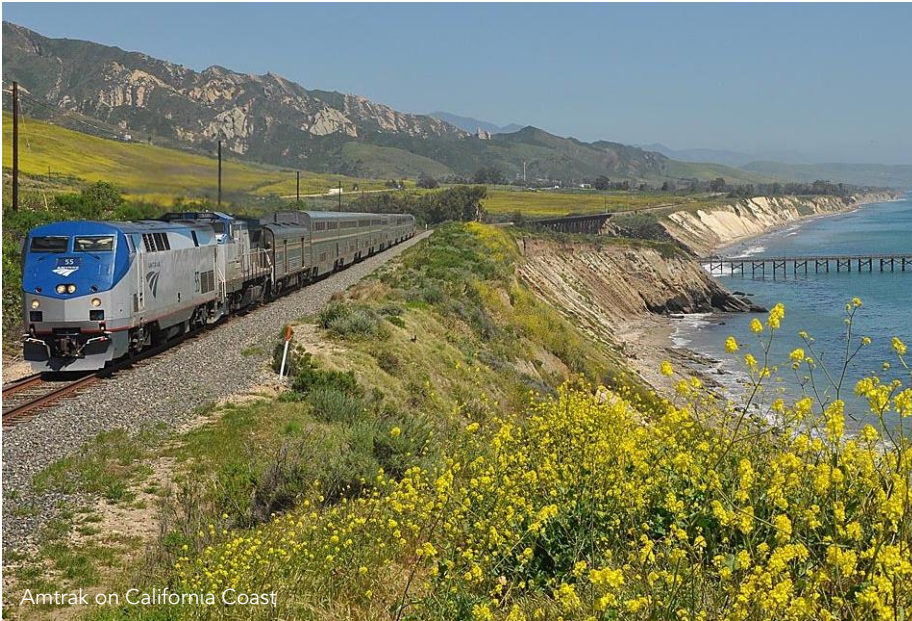
Amtrak on California Coast