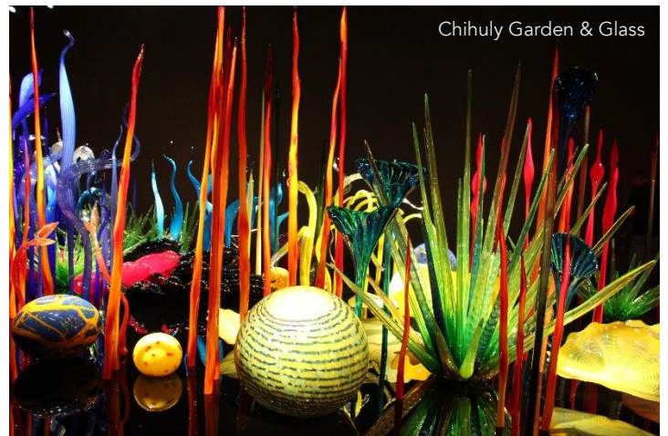
Chihuly Garden & Glass