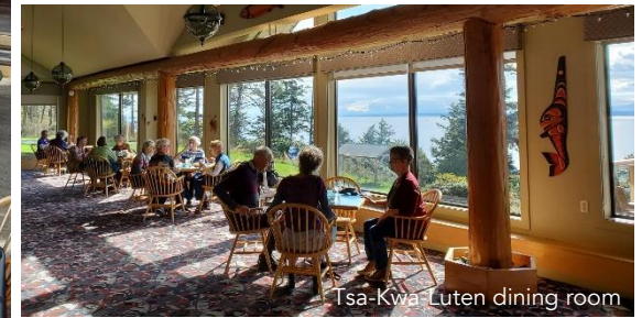
Tsa-Kwa-Luten dining room