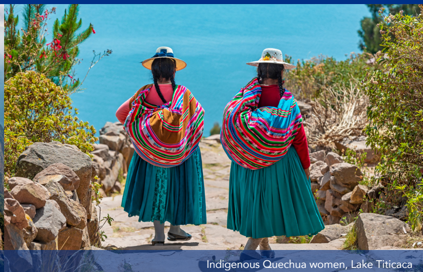
Indigenous Quechua women, Lake Titicaca

This epic tour begins in Peru where we explore Lima, the modern capital, and Cusco, the capital of the 12th century Inca Empire. We enjoy a flight over the mysterious Nazca Lines, visible only from the air. Next, we cruise to the Ballestas Islands, which are noted for their great variety of birdlife. We take an awesome train excursion from the Sacred Valley through the rugged Andes to the ruins of Machu Picchu. This archeological wonder majestically crowns a 3,000-metre high ridge and was hidden from the world until its rediscovery 113 years ago. A day's drive from Cusco takes us to Puno, a resort on the north shore of magnificent Lake Titicaca. Two boat excursions on the world's highest navigable lake are arranged, one to the Uros Floating Islands and one to Isla del Sol. Nearby are the ruins of Tiwanaku which date from 1580 BC. The tour finishes in La Paz, the historic capital of Bolivia.