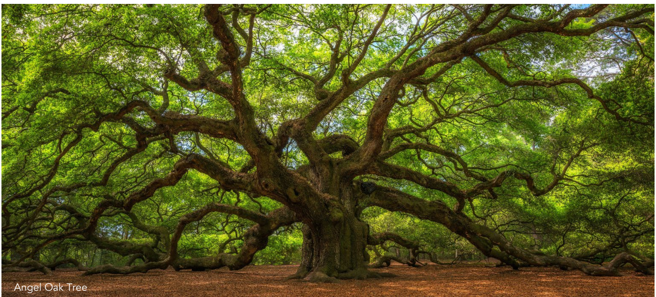
Angel Oak Tree

Moderate activity including walking tours of historic homes and gardens which usually require some stairs and standing. There are three boat excursions which may have steep gangways to access the vessel, depending on tides. Charleston and Savannah have historic districts where coaches are restricted, so walking tours are offered which may be on cobblestone streets or uneven sidewalks. The coach cannot carry a scooter or motorized wheelchair. There can be longer walks in the airports. Everybody participating in this tour is expected to be capable of handling Activity Level 2. The tour director and driver have many responsibilities, so please do not expect them, or your fellow travellers, to provide ongoing assistance. If you are not capable of keeping up with the group or require frequent assistance, the tour director may stop you from participating in some activities or some tour days. In extreme situations, you may be required to leave the tour and travel home at your own expense; travel insurance will probably not cover you.