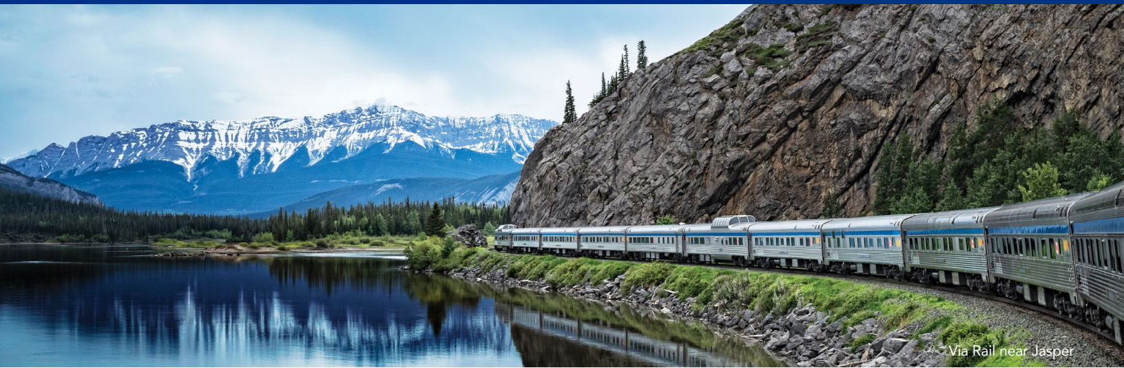
Via Rail near Jasper

The railway in Canada is an integral and essential foundation for the country. When the last spike of the cross-country rail line was driven at Craigellachie on November 7, 1885, something truly magnificent had been accomplished: Canada had been united. The railway was written into the agreement of Confederation on that historic day when the Dominion of Canada was formed in 1867. The project was a condition of entry into Confederation by British Columbia and it was the common thread that linked the vast spaces and diverse cultures of the grand new nation. Experience Canada's national railway on this epic journey from Vancouver on the Pacific Coast to Halifax on the Atlantic Coast. From the soaring giants of the Rocky Mountains to the sea of grass in the vast prairies; from the unique mix of cultures in Montréal to the Scottish influence in the Maritimes; from the awesome view at Niagara's Skylon Tower to the iconic Peggy's Cove — all aboard for the adventure of a lifetime!