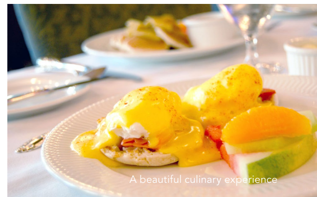
A beautiful culinary experience