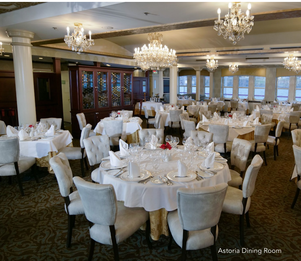
Astoria Dining Room