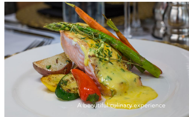
A beautiful culinary experience