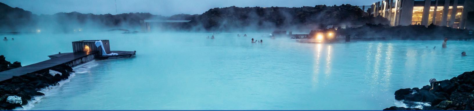
Blue Lagoon, Iceland