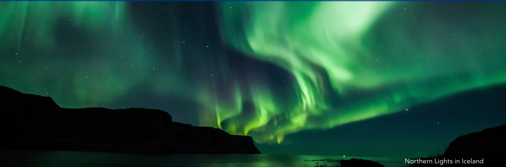
Northern Lights in Iceland