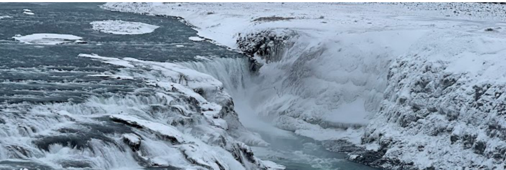
Gullfoss waterfall, Iceland

Luggage Handling: There are no luggage porters (bell staff) at any of the hotels where we stay in Iceland. Please be prepared to carry your own luggage from the coach to your room and back. Luggage handling is provided at the Vancouver hotels.