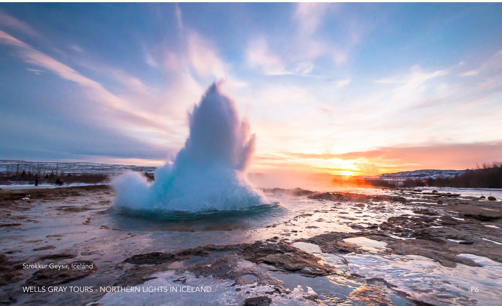
Strokkur Geysir, Iceland

Meals included: ① Breakfast, Lunch ② Breakfast