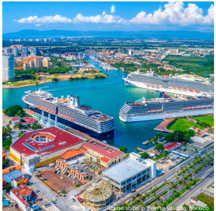
Cruise ships in Puerto Vallarta, Mexico

Providing Quality Packaged Travel Since 1972