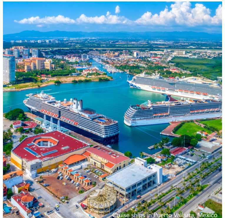
Cruise ships in Puerto Vallarta, Mexico

Providing Quality Packaged Travel Since 1972