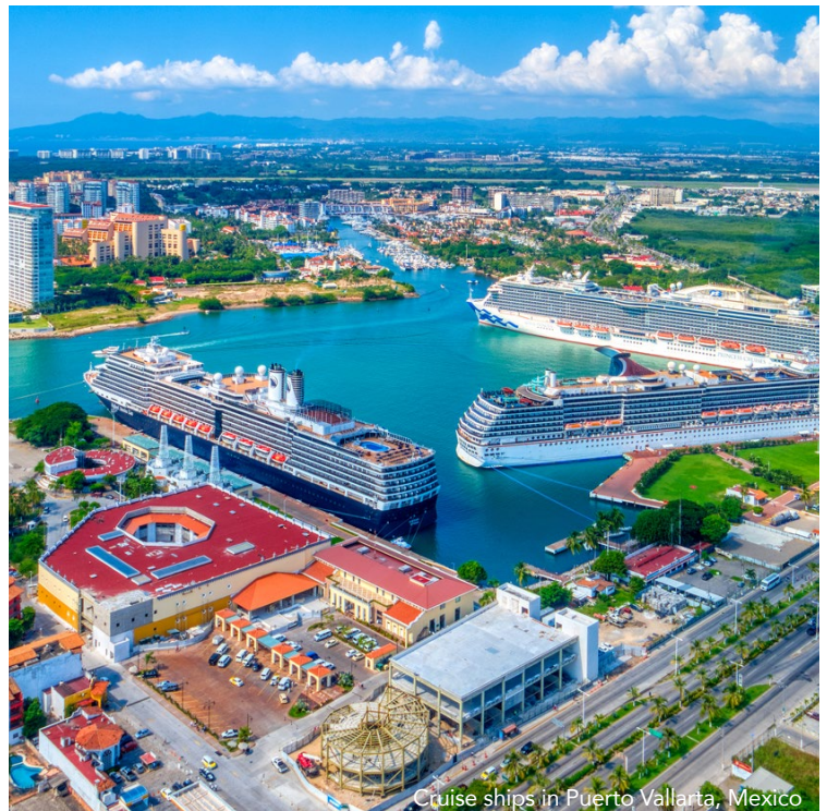
Cruise ships in Puerto Vallarta, Mexico

Providing Quality Packaged Travel Since 1972