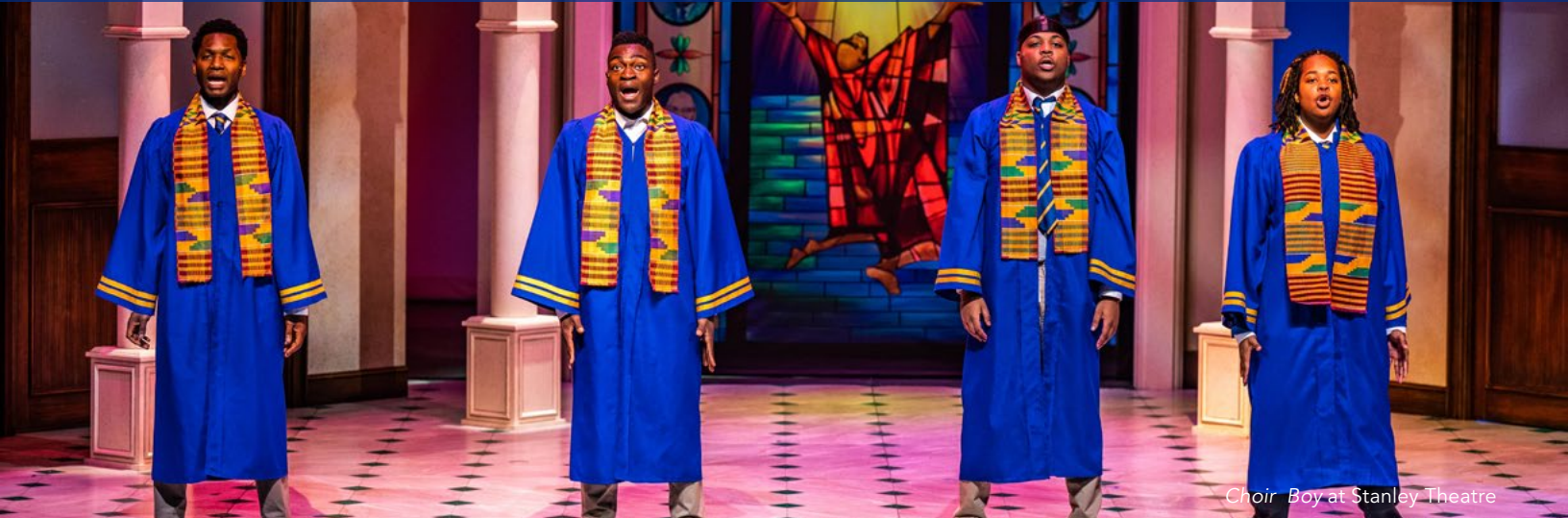
Choir Boy at Stanley Theatre

Enjoy this short get away to the coast, featuring 3 shows at Vancouver theatres. The first show is Every Brilliant Thing at the intimate Newmont Stage. Next is Anne of Green Gables The Ballet , at the Massey Theatre in New Westminster, a different take on the beloved PEI story. The last show, at the Stanley Theatre, is Choir Boy . During the rest of the weekend, you can choose between the Vancouver Aquarium or the Museum of North Vancouver or opt out to have time to visit friends or relatives in Vancouver. Another attraction is the heritage Roedde House Museum. We have selected some different activities in Vancouver since theatre tours are offered several times a year. We stay 3 nights at the Blue Horizon Hotel on Robson Street, surrounded by dozens of interesting shops and restaurants, and a short walk to Pacific Centre Mall.