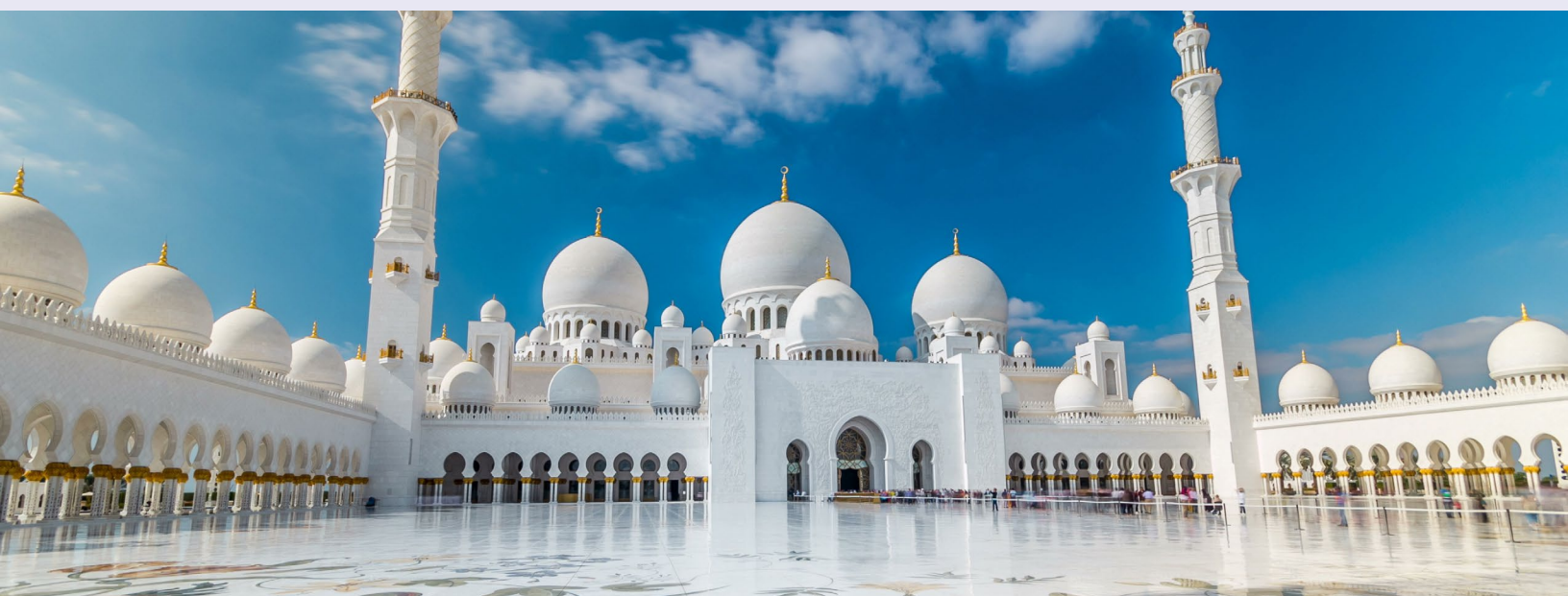
Sheikh Zayed Grand Mosque

Many shore excursions on this tour are not appropriate for people who require the use of a walker. There are many stops during the land tours and you must be able to get on and off the coach by yourself without delaying your fellow travellers. The coaches cannot carry a scooter or motorized wheelchair. The tour director and driver have many responsibilities, so please do not expect them, or your fellow travellers, to provide ongoing assistance. If you are not capable of keeping up with the group or require frequent assistance, the tour director may stop you from participating in some activities or some days of the tour. In extreme situations, you may be required to leave the tour and travel home at your own expense; travel insurance will probably not cover you.