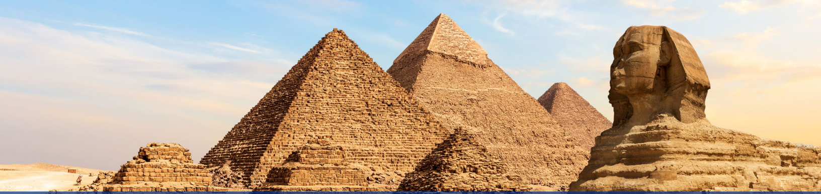
Pyramids of Giza and Sphinx