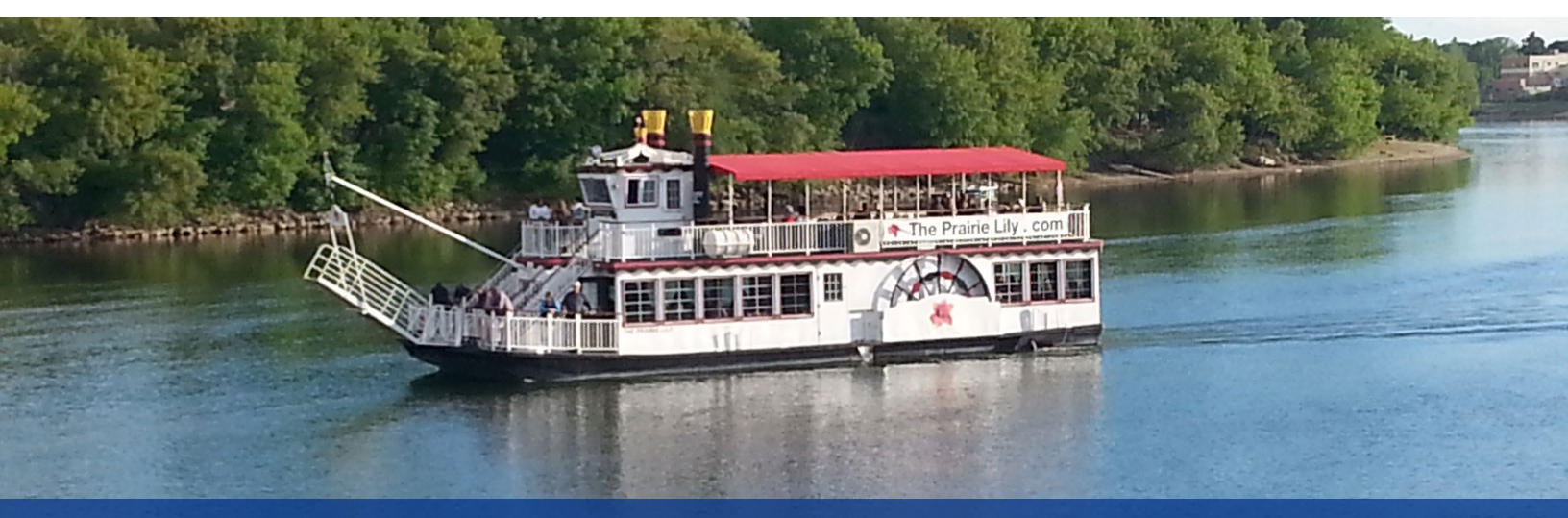
Prairie Lily sternwheeler

Consumer Protection BC Licences: Kamloops 178, Vernon 655, Kelowna 588, Penticton 924, Victoria 65842