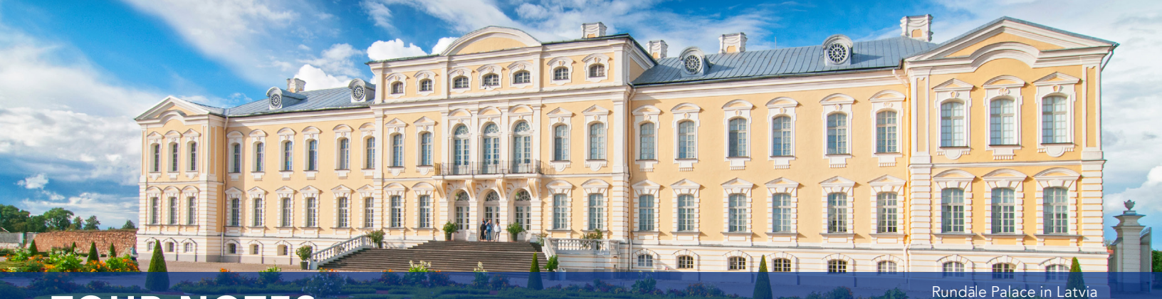
Rundāle Palace in Latvia