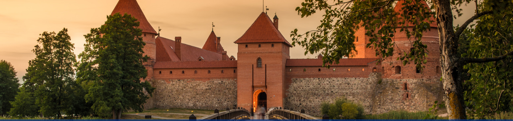
Trakai Island Castle in Lithuania