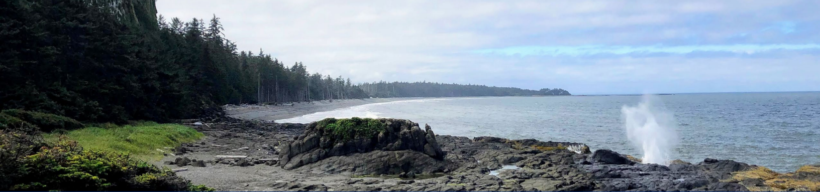
Beaches near Tow Hill