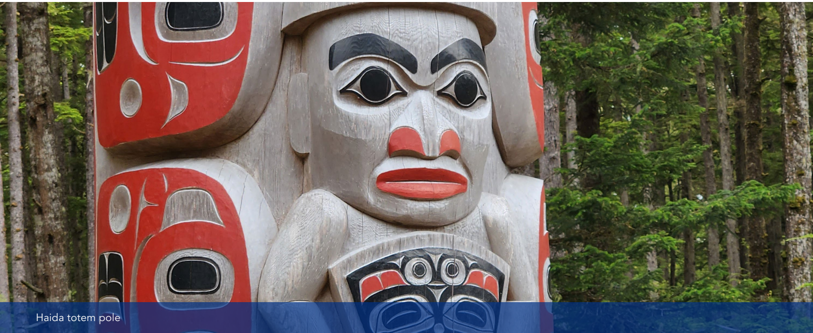
Haida totem pole