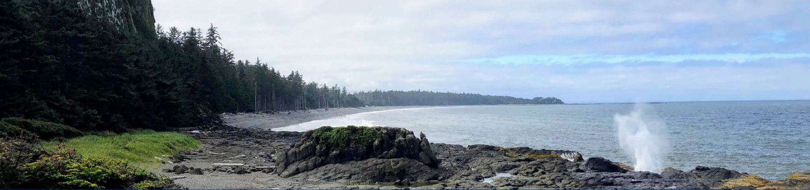
Beaches near Tow Hill