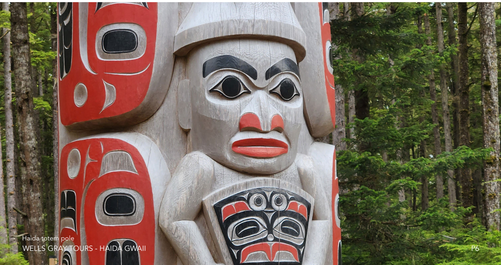
Haida totem pole WELLS GRAY TOURS - HAIDA GWAI

Identification: You must bring government-issued photo ID with you, such as a passport or BC Services Card / Driver's Licence. Otherwise, you will not be allowed to board the flights.