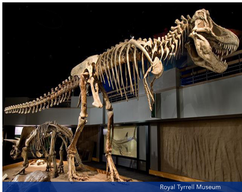
Royal Tyrrell Museum

BC Interior, Vancouver Island & Lower Mainland