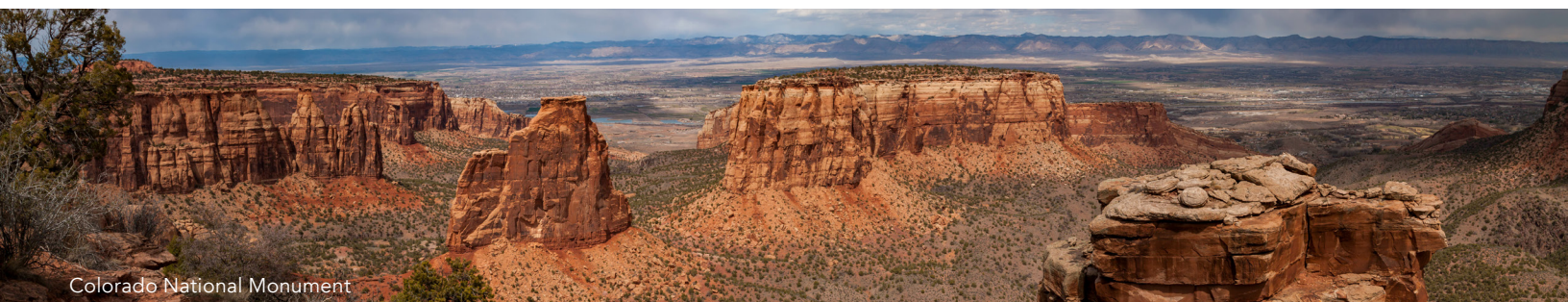
Colorado National Monument