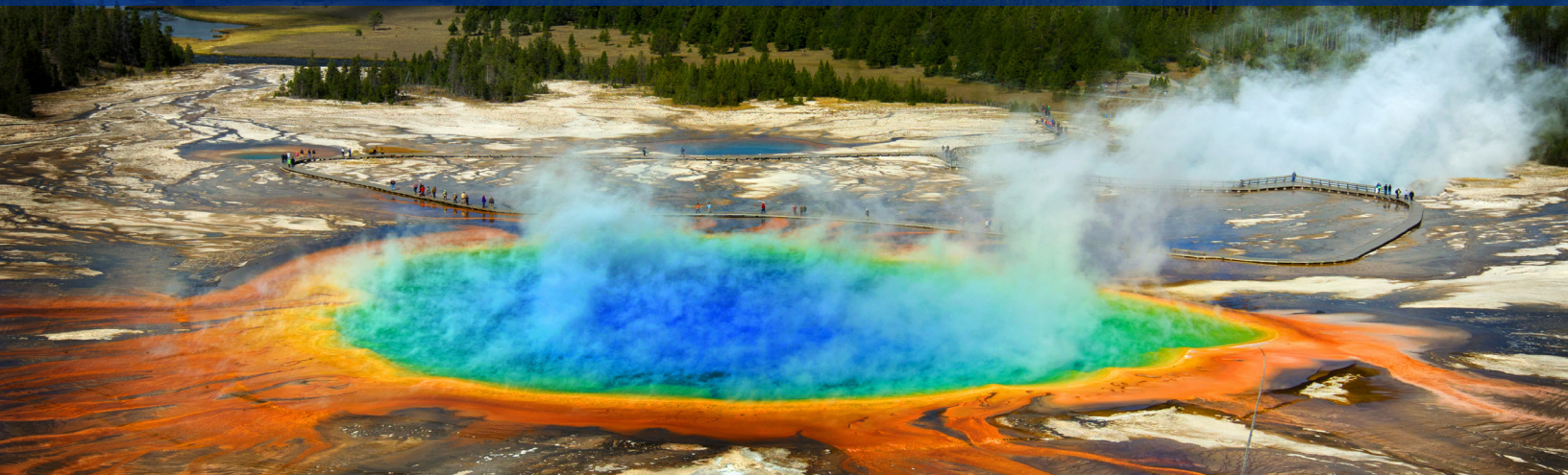
Grand Prismatic Pool at Yellowstone National Park