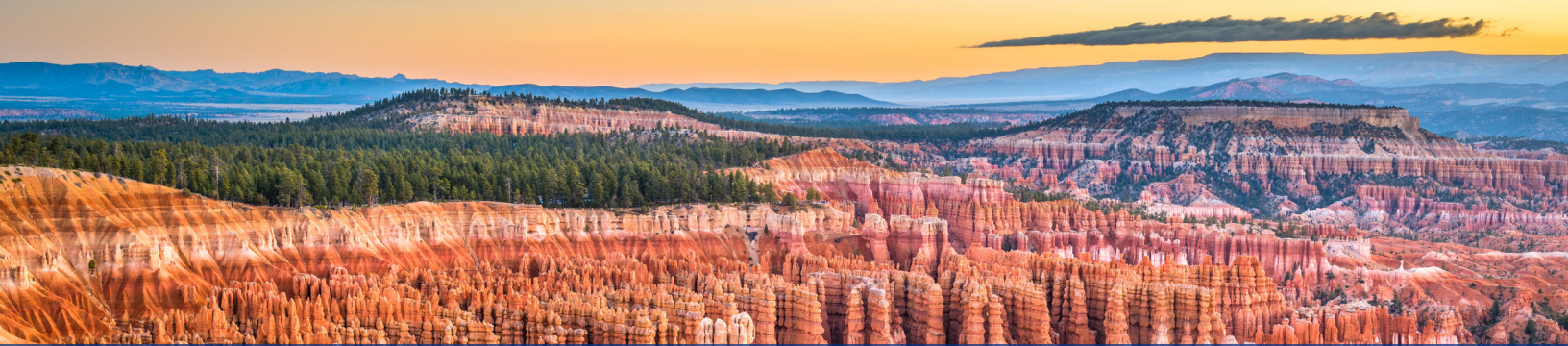
Bryce Canyon National Park