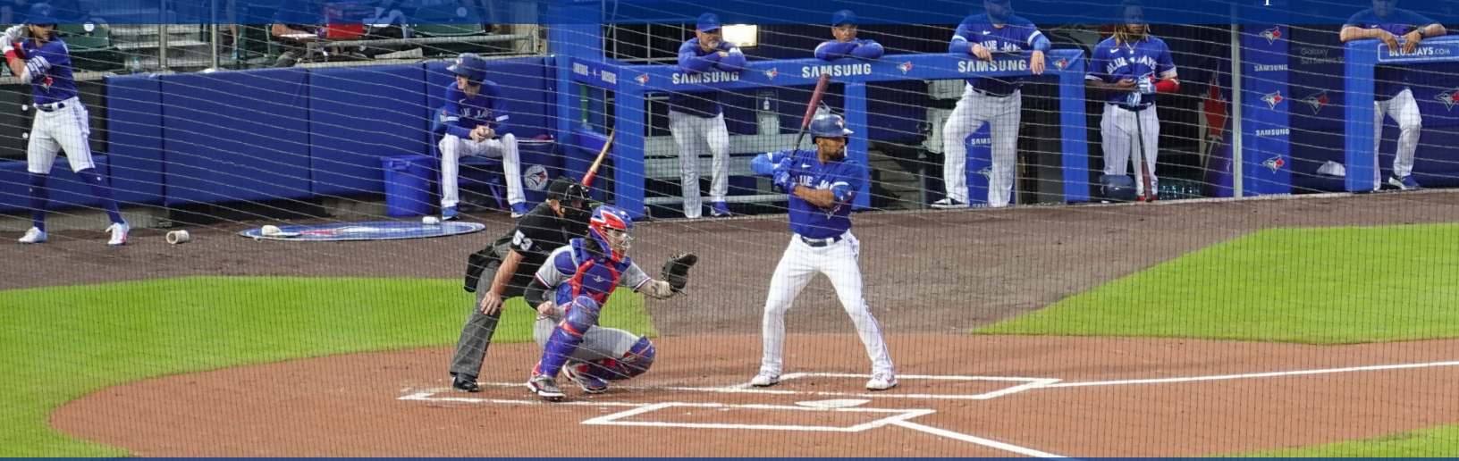
Toronto Blue Jays

Join Wells Gray Tours and your fellow baseball fans as we head to Seattle to catch the Blue Jays' three-game series against the Mariners! Enjoy our 4-star hotel located right in the heart of downtown Seattle, just a few blocks from the flying fish at Pike Place Market. Don't miss the pre-game tour of T-Mobile Park, batting practice, and a couple of great Seattle attractions during this 5-day tour. Be a part of the buzz and excitement as many other Canadians from Western Canada also make the trip to Seattle to catch their beloved Blue Jays baseball team. Don't forget that the Blue Jays only come to Seattle once each season so this is the perfect time to visit the Emerald City! Play Ball!