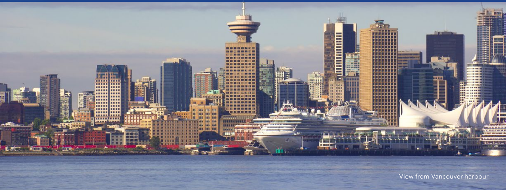
View from Vancouver harbour

Enjoy this short mid-week get-away, featuring 2 shows at Vancouver theatres. The first show is Jersey Boys at the Stanley Theatre and the other is Come From Away at the Queen Elizabeth Theatre. Vancouver theatre tours are offered several times a year, so you probably don't want to see the same attractions each time. For this tour, we are including visits to VanDusen Botanical Garden and Britannia Shipyards National Historic Site, and a cruise around the Vancouver harbour. Since rooms are very expensive in downtown Vancouver in September, we are staying 2 nights at the Inn at the Quay in New Westminster with a view of the Fraser River from every room. The Westminster Quay Market adjacent.