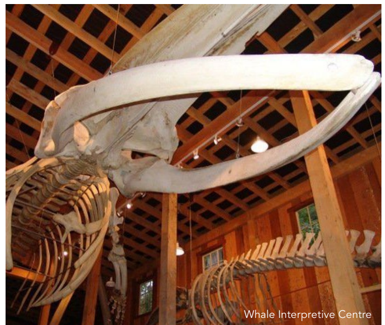
Whale Interpretive Centre

Providing Quality Packaged Travel Since 1972