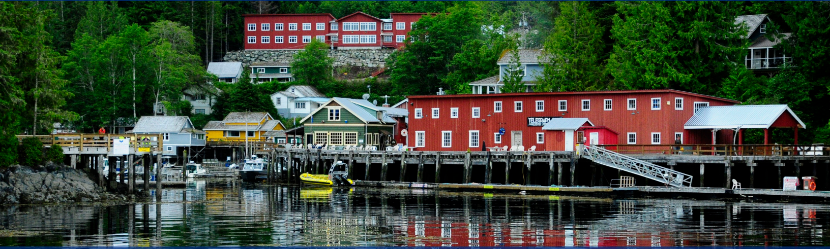
Telegraph Cove Resort