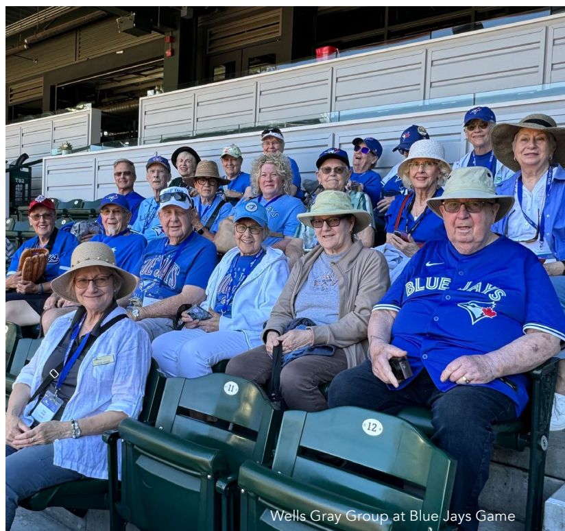
Wells Gray Group at Blue Jays Game