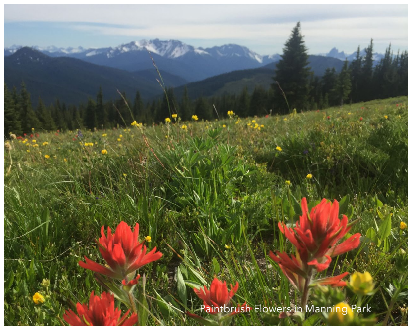
Paintbrush Flowers in Manning Park

Providing Quality Packaged Travel Since 1972