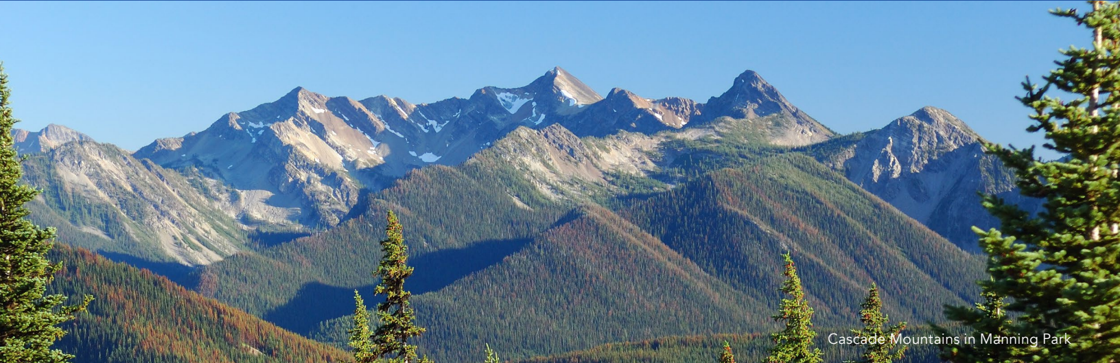
Cascade Mountains in Manning Park