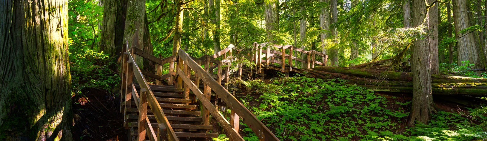
Giant Cedars Boardwalk