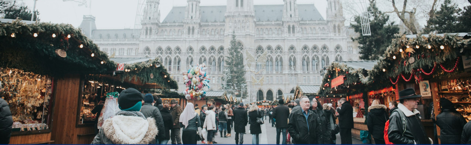
Vienna Christmas Market