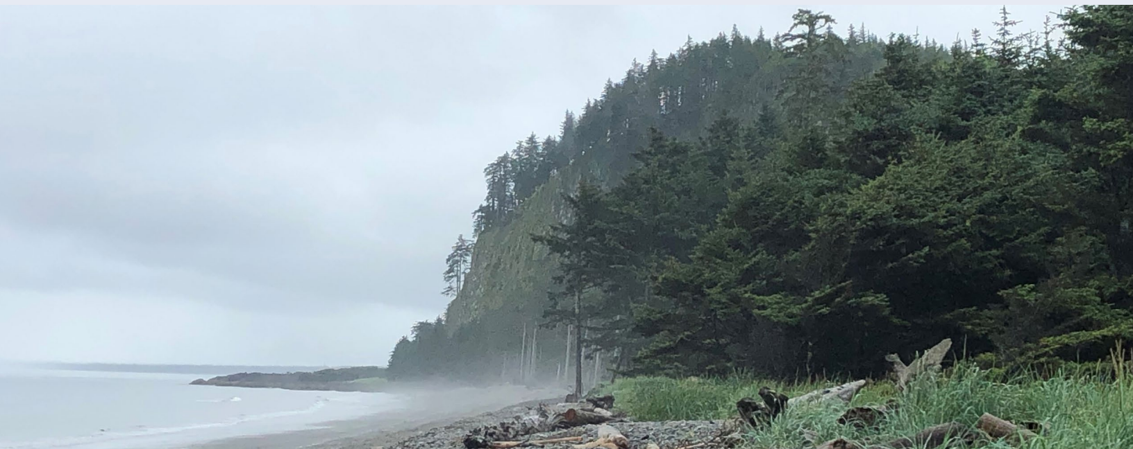
Tow Hill from Agate Beach

Thank you Wells Gray Tours for offering a tour to this part of the world that is not so easy to get to, it was truly a chance of a lifetime.