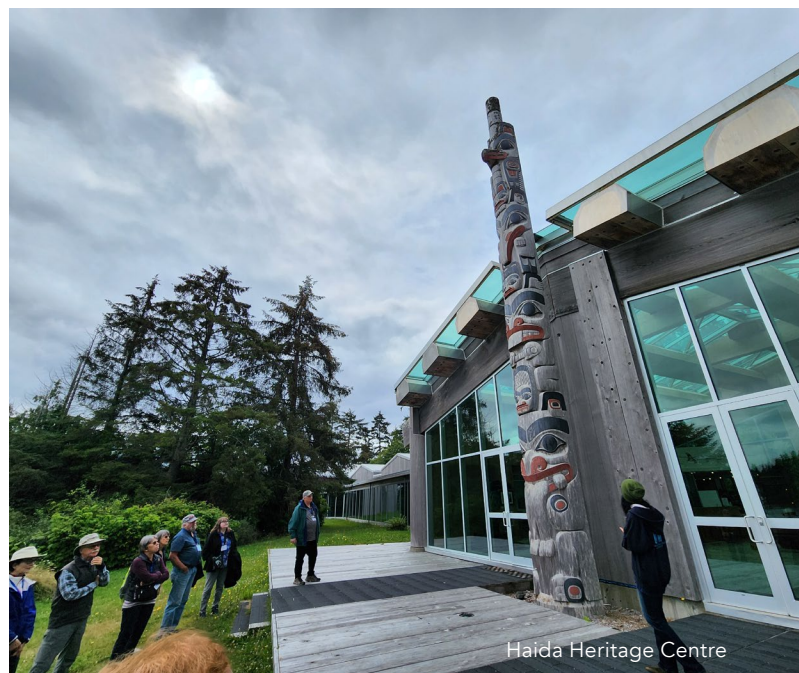
Haida Heritage Centre

Providing Quality Packaged Travel Since 1972