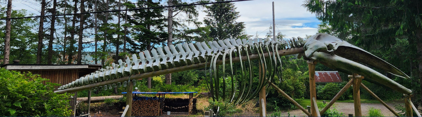
Whale Skeleton in Tlell