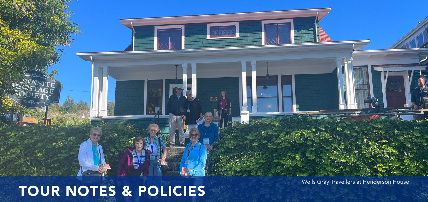
Wells Gray Travellers at Henderson House