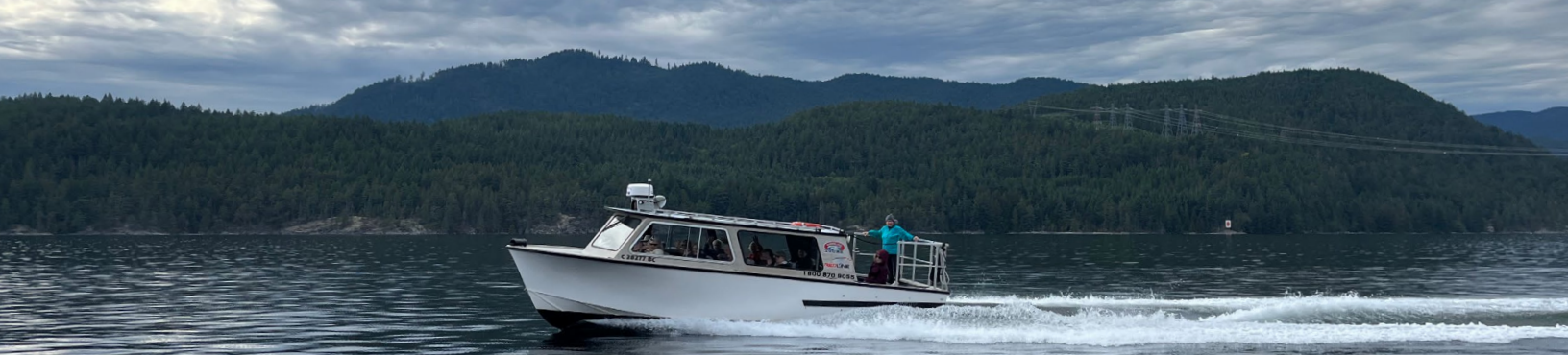
Cruise through Agamemnon Channel