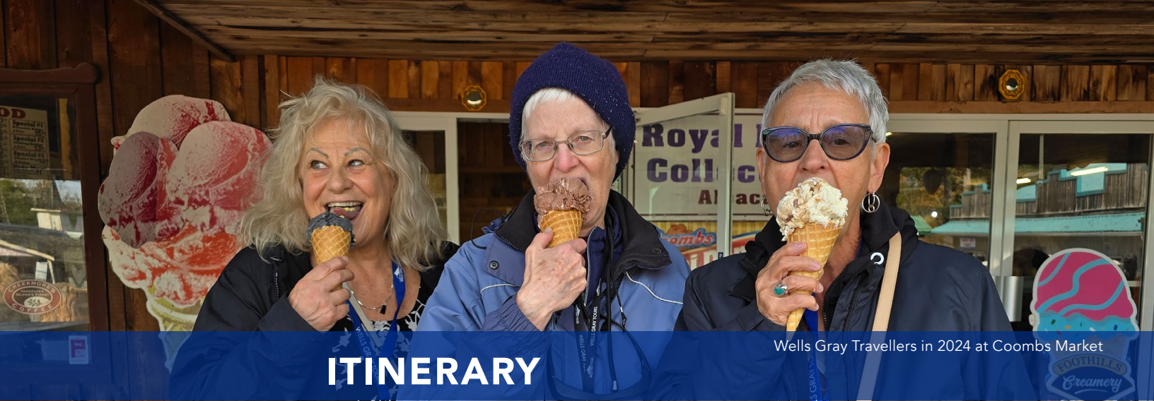
Wells Gray Travellers in 2024 at Coombs Market