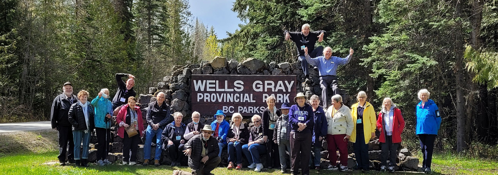
Wells Gray Group at Park Entrance